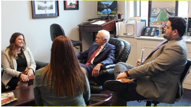
// FELLOWS MEET WITH REPRESENTATIVE JACK BERGMAN