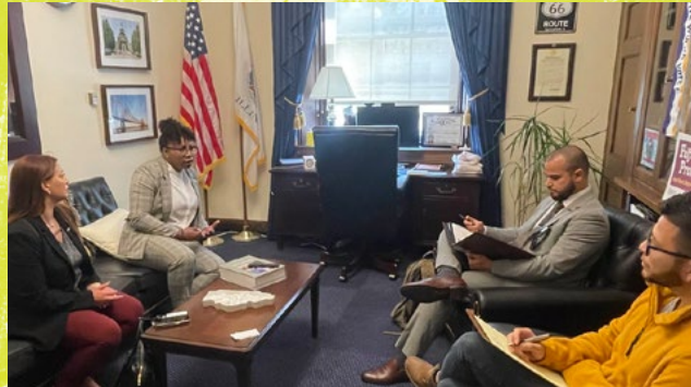
// FELLOWS MEET WITH REPRESENTATIVE NIKKI BUDZINSKI'S OFFICE