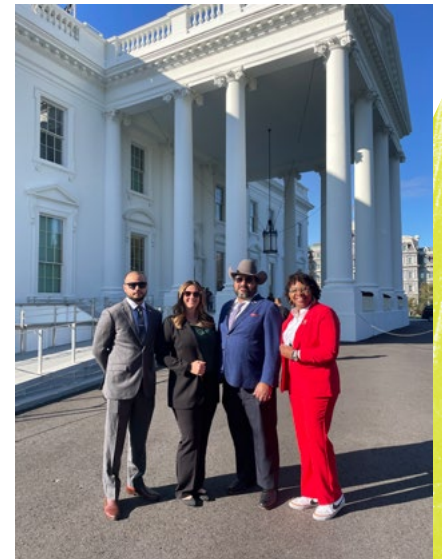
// IAVA LEADERSHIP FELLOWS VISIT THE WHITE HOUSE

In the fall of 2023, we also launched a pilot of what is now IAVA's Leadership Fellowship program, representing the next level of participation in IAVA's Cavalry. This program invests in our most promising members through hybrid training that includes virtual education, assignments, and the opportunity to hear from guest speakers. We then bring the Cavalry back to Washington, D.C., for in-person instruction and meetings with lawmakers, their staff, and the media. The goal of this program is to empower our members with some of the same skills that IAVA staff possess so that they can lead teams of IAVA members in Washington and their fellow veterans back home in their communities. //